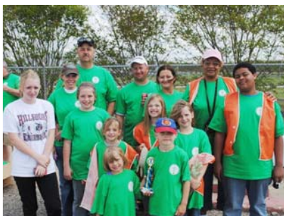
Members of the Hillsboro Boys & Girls Club are pictured with the trophy awarded for picking up the most trash.

This year's City-Wide Clean Up was held on Saturday, April 10th. The community event allowed citizens to dispose of debris locally, and for civic minded individuals and groups to work together in helping the beautification of Hillsboro. This event could not have taken place without the hard work of the members of the Hillsboro Public Works and Police Departments and the other City of Hillsboro department members who contributed their time and effort.