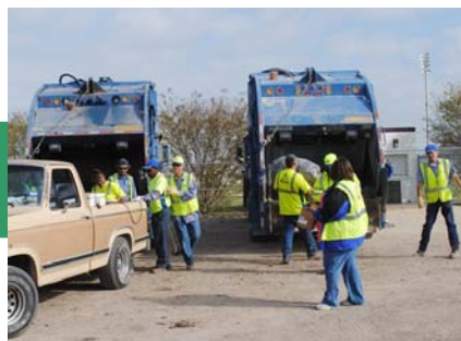
Employees of Trinity Waste and the Hillsboro Public Works Department worked alongside one another to help with the beautification of Hillsboro.