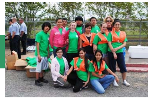
HISD's Business Professionals of America were awarded the trophy for the largest group, totaling 13 volunteers.