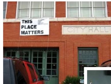
National Trust for Historic Preservation Theme for the month of May is displayed on facade of the Historic City Hall.